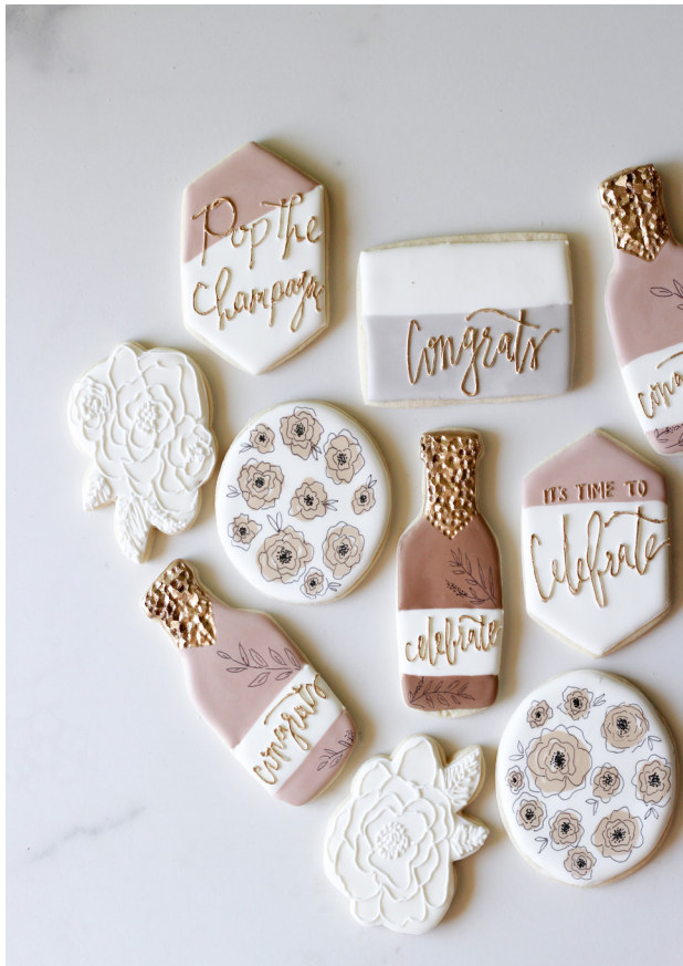
Engagment Party Cookies

All sugar cookies are able to have custom colors, custom monogram or wording & Custom shapes