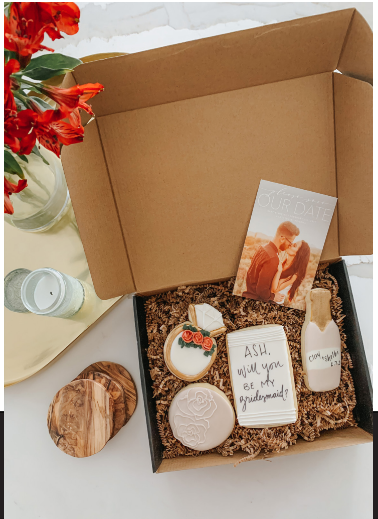
Custom thank you cookies